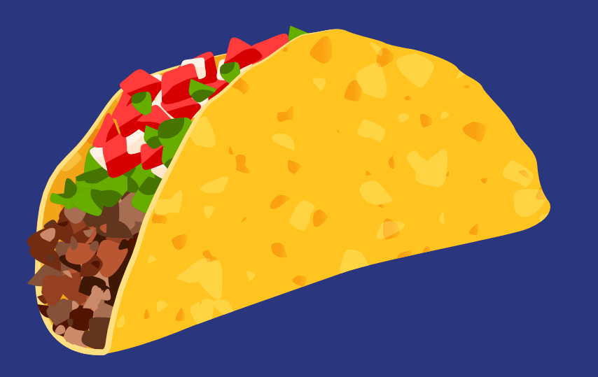
Got questions? Let's taco bout it.