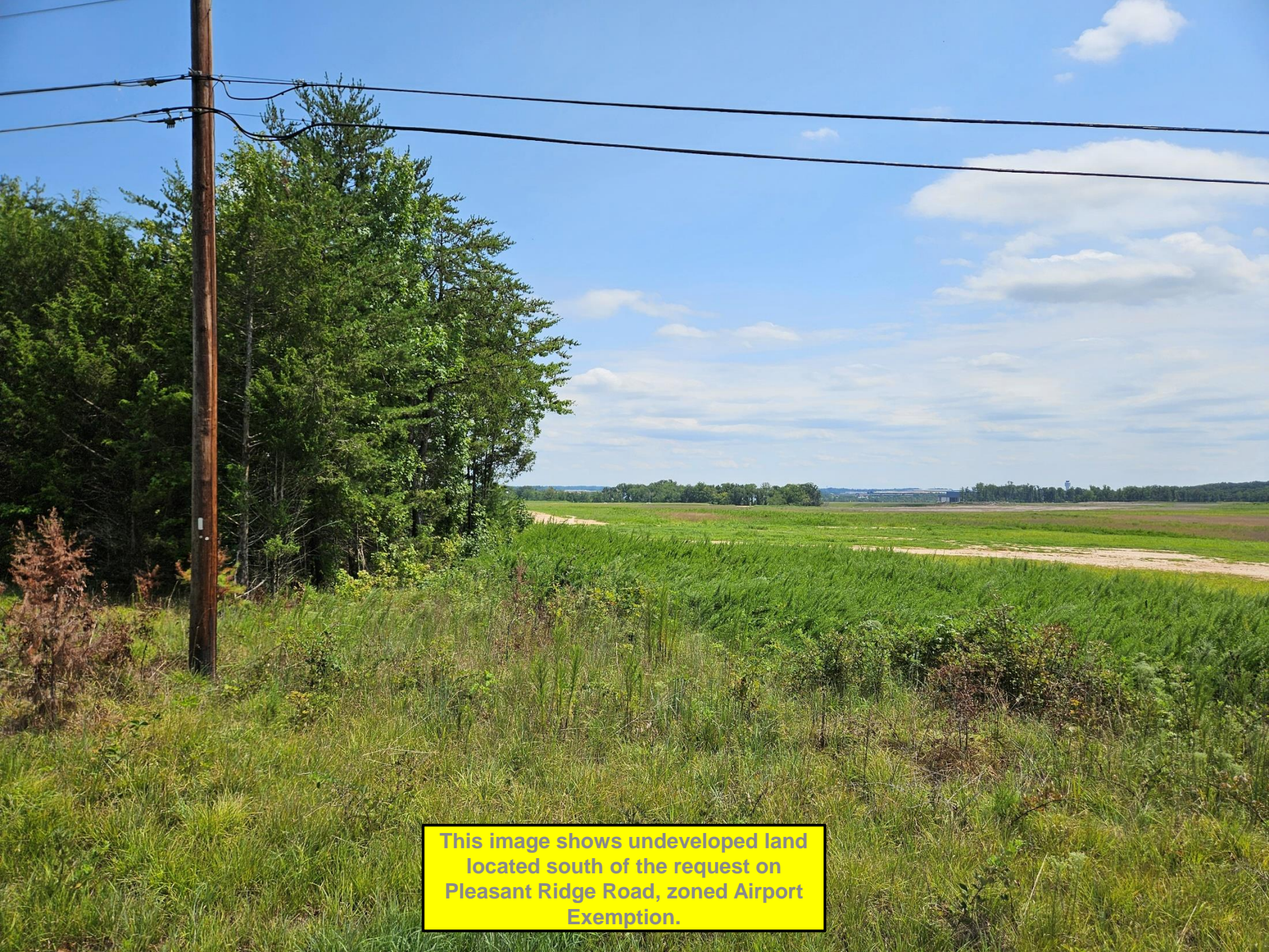
This image shows undeveloped land located south of the request on Pleasant Ridge Road, zoned Airport Exemption.