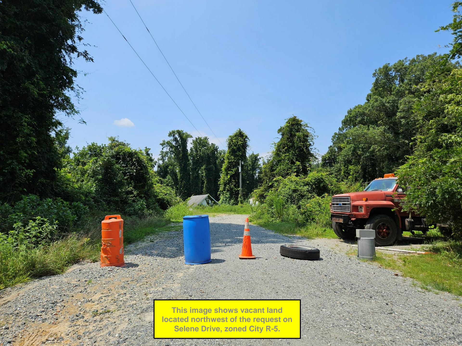
This image shows vacant land located northwest of the request on Selene Drive, zoned City R-5.