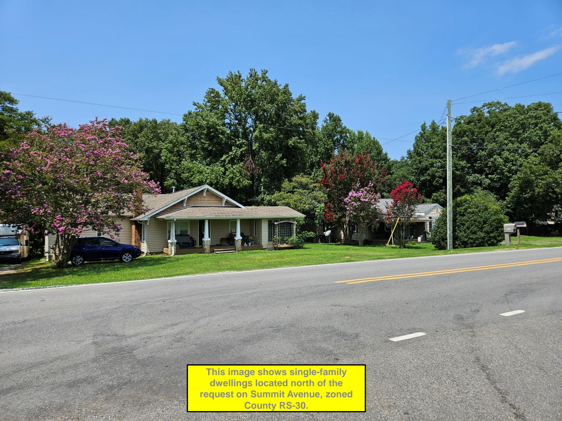
This image shows single-family dwellings located north of the request on Summit Avenue, zoned County RS-30.