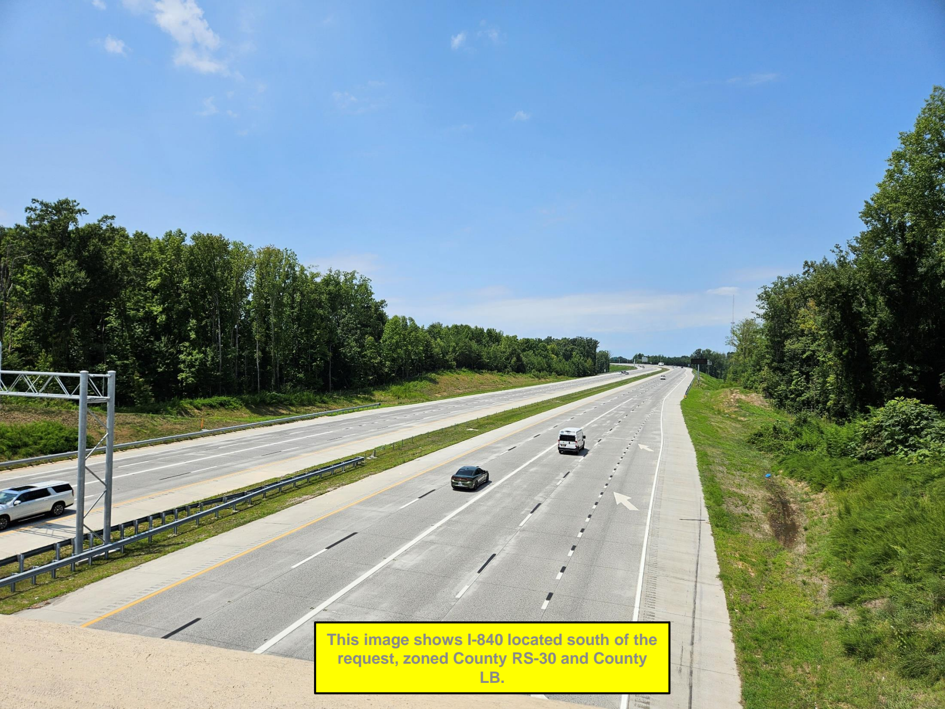
This image shows I-840 located south of the request, zoned County RS-30 and County LB.