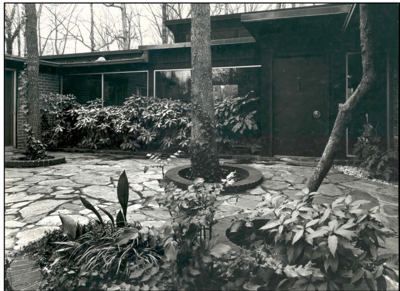
Figure 2: 1974 photograph by Danny Fafard. Brick-edged planters on the front terrace were removed when the trees within them died.

The house is approached from Granville Street on the west via a semi-circular, pea gravel driveway that extends to the carport. The south half of the driveway is wider to accommodate parking. The space within the circular drive, adjacent to the road, retains mature trees, including a large magnolia tree that partially screens the view of the house and carport from Granville Road.