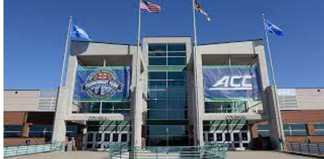
Project: General Government Services (FY 2022-2023)