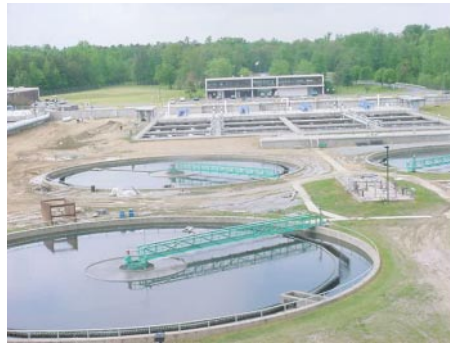
T. Z. Osborne Plant (located off of Huffine Mill Road)

Both City water reclamation facilities are large, complex, plants that use physical, chemical, and biological processes to clean the wastewater. It is screened and settled to remove most suspended materials, but the heart of the plant is a biological process that uses bacterial cultures to remove the largest part of the suspended and dissolved wastes that are produced within the city. This biological process, called activated sludge, is sensitive to temperature, high flows produced by rainfall leaking into sewers, and toxic discharges that can be produced by industries or even homes. This sensitivity to factors largely beyond the control of the operators of the plants makes them susceptible to process upsets that can result in discharging constituents beyond the amount permitted by regulating authorities.