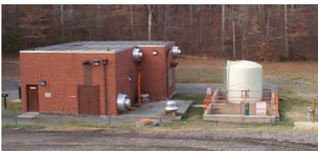
Rock Creek Pump Station

Nearly all of the sewage or wastewater that is generated by customers flows by gravity through sewers that range from 6 to 72 inches in diameter. Greensboro operates over 1,340 miles of these gravity sewer lines. As the lines leave neighborhoods they increase in size to accommodate the flows that are collected from the many areas that are served. These sewers generally follow terrain to take advantage of gravity flow but at certain low points pumping stations are used to push the flow uphill to the next drainage basin and set of lines. The City currently operates 45 pumping stations that range in capacity from 30 to 2,600 gallons per minute.