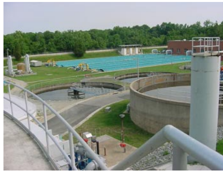
North Buffalo Plant (located off of White Street)

Our sewer collection system transports Greensboro's wastewater to two large water reclamation facilities. The wastewater is processed so that it can be returned to our streams with minimal environmental impact. The North Buffalo Facility and the T.Z. Osborne Facility are permitted to process up to 16 and 40 million gallons of wastewater per day, respectively.