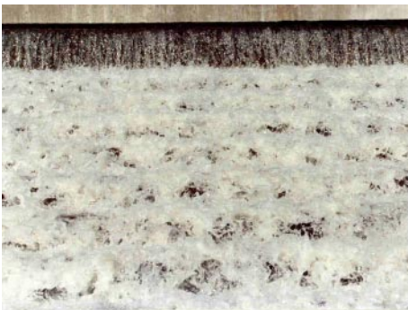
Clean Water returned to our streams

During 2004 the Water Resources Department treated over 11.5 billion gallons of wastewater and returned it to our streams.