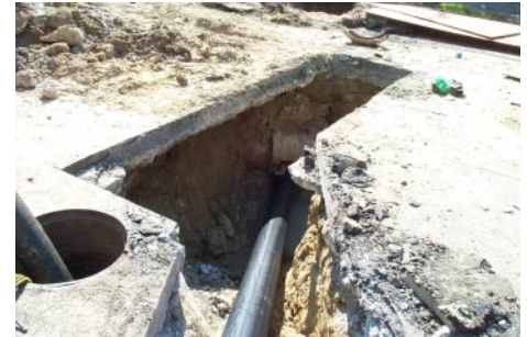
Sewer Line Rehabilitation

The City of Greensboro has an on-going cleaning and inspection program to monitor and maintain our sewer system, including rodding, high pressure flushing, and closed circuit television inspection of lines. The City has an aggressive program to rehabilitate old leaking sewer lines to begin reducing the amount of rainwater entering our collection system. Spending for rehab exceeds $1.75 million per year.