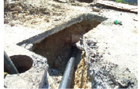
Sewer Line Rehabilitation

The City of Greensboro has an on-going cleaning and inspection program to monitor and maintain our sewer system, including rodding, high pressure flushing, and closed circuit television inspection of lines. The City has an aggressive program to rehabilitate old leaking sewer lines to begin reducing the amount of rainwater entering our collection system. Spending for rehab exceeds $1.75 million per year.