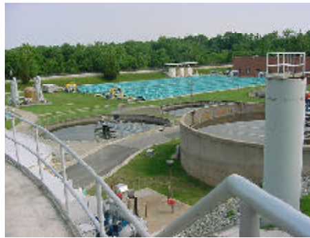
North Buffalo Plant (located off of White Street)

Our sewer collection system transports Greensboro's wastewater to two large water reclamation facilities. The wastewater is processed so that it can be returned to our streams with minimal environmental impact. The North Buffalo Facility and the T.Z. Osborne Facility are permitted to process up to 16 and 40 million gallons of wastewater per day, respectively.