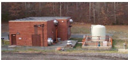
Rock Creek Pump Station

Nearly all of the sewage or wastewater that is generated by customers flows by gravity through sewers that range from 6 to 72 inches in diameter. Greensboro operates over 1,340 miles of these gravity sewer lines. As the lines leave neighborhoods they increase in size to accommodate the flows that are collected from the many areas that are served. These sewers generally follow terrain to take advantage of gravity flow but at certain low points pumping stations are used to push the flow uphill to the next drainage basin and set of lines. The City currently operates 44 pumping stations that range in capacity from 30 to 2,600 gallons per minute.