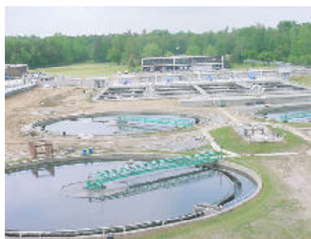
T. Z. Osborne Plant (located off of Huffine Mill Road)

Both City water reclamation facilities are large, complex, plants that use physical, chemical, and biological processes to clean the wastewater. It is screened and settled to remove most suspended materials, but the heart of the plant is a biological process that uses bacterial cultures to remove the largest part of the suspended and dissolved wastes that are produced within the city. This biological process, called activated sludge, is sensitive to temperature, high flows produced by rainfall leaking into sewers, and toxic discharges that can be produced by industries or even homes. This sensitivity to factors largely beyond the control of the operators of the plants makes them susceptible to process upsets that can result in discharging constituents beyond the amount permitted by regulating authorities.