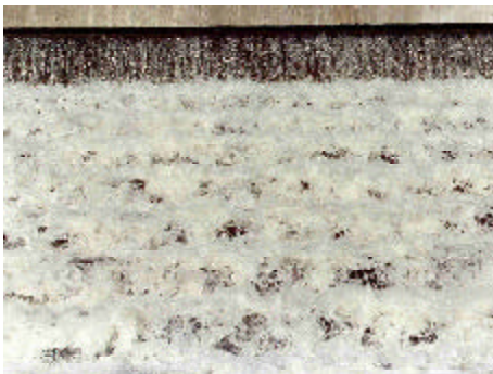
Clean Water returned to our streams

During 2003 the Water Resources Department treated over 13.1 b illion gallons of wastewater and returned it to our streams.