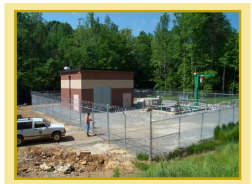
Kenneth Road Pump Station

Sewage spills from a collection system can be caused by a number of reasons. Tree roots can find their way into sewer lines obstructing them, grease from residences or commercial establishments can collect in sewers and obstruct them, foreign objects can be dropped in sewers or manholes, rainwater can find its way into sewers overloading them, and pump stations can fail for mechanical or electrical reasons. Greensboro, like all cities, has experienced these problems in the last year of operation. A list of sewage spills in excess of 1,000 gallons that reached surface waters is included at the end of this report as Table 3. There were no detected environmental impacts from any of these incidents.