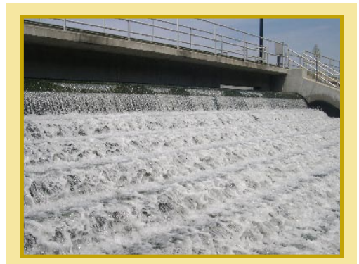
Clean water returns to our streams

During 2008 the Water Resources Department treated 10.5 billion gallons of wastewater and returned it to our streams. We are proud of the outstanding performance of these facilities that was made possible by the dedicated efforts of the professionals who operate, maintain, and conduct tests for these facilities. However, despite these efforts we reported the following violations of the NPDES permit to the state. Each and every one of these was reported to the State of North Carolina in compliance with all reporting regulations and is included at the end of this report as Table 1 (T. Z. Osborne) and Table 2 (North Buffalo). There were no detected environmental impacts from any of these permit excursions.