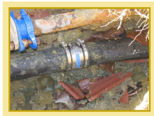
Sewer Line Rehabilitation Procedure known as “sliplining”

We are also enhancing our regulation of grease discharge in those areas where we are experiencing grease buildup in lines. While we maintain generators at many stations and can move mobile generators to the others, we are investigating the installation of automatic backup at stations that experience repeat loss of power that cannot be restored quickly. It should be noted that of the 10.5 billion gallons of sewage produced in Greensboro in 2008, 323,600 gallons escaped our system, which is only 31 gallons per million transported.