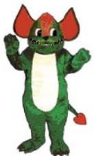
FOG Mascot “Grease Gremlin”

It is the duty and responsibility of the City of Greensboro Water Resources Department to prevent the excessive introduction of oil and grease into the sanitary sewer system and the wastewater treatment plants. This policy is designed to outline, implement and enforce oil and grease discharge rules and to have an educational program for both residential and commercial users. This policy is applicable to all “Food Service Establishments” that discharge wastewater containing grease to the City of Greensboro Sanitary Sewer System. In order to reduce sewer blockages, Food Service Establishments discharging wastewater that contains grease to the City of Greensboro sanitary sewer system must install and maintain a grease trap or grease interceptor to prevent grease from entering the sewer system. The accumulation of grease within sanitary sewer lines increases the potential to create sewer blockages. Sanitary sewer blockages can result in sanitary sewer overflows (SSOs), which may reach the surface waters of North Carolina.