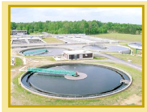
T. Z. Osborne Plant (located off of Huffine Mill Road)

Both City water reclamation facilities are large, complex, plants that use physical, chemical, and biological processes to clean the wastewater. It is screened and settled to remove most suspended materials, but the heart of the plant is a biological process that uses bacterial cultures to remove the largest part of the suspended and dissolved wastes that are produced within the city. This biological process, called activated sludge, is sensitive to temperature, high flows produced by rainfall leaking into sewers, and toxic discharges that can be produced by industries or even homes. This sensitivity to factors largely beyond the control of the operators of the plants makes them susceptible to process upsets that can result in discharging constituents beyond the amount permitted by regulating authorities.