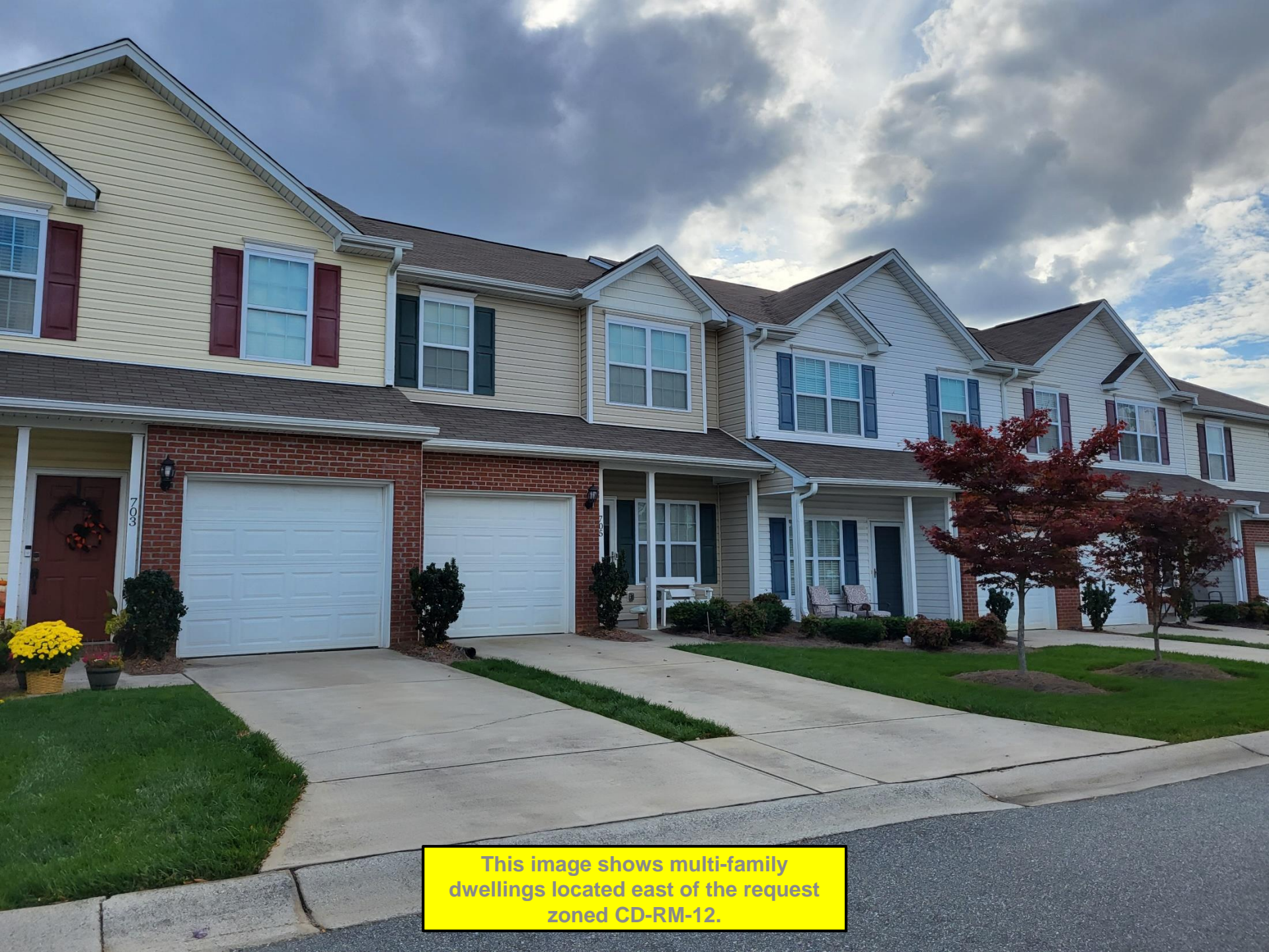
This image shows multi-family dwellings located east of the request zoned CD-RM-12.