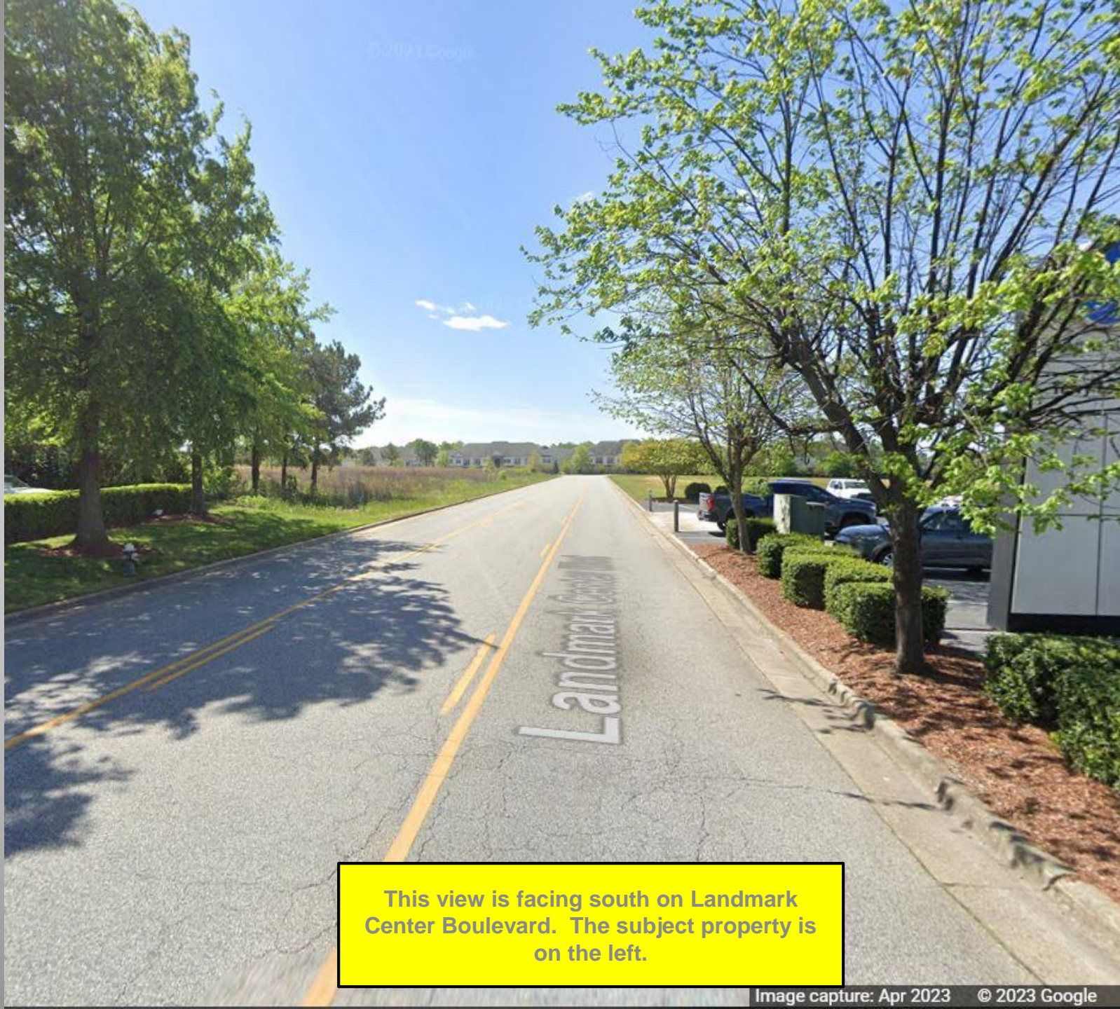
This view is facing south on Landmark Center Boulevard. The subject property is on the left.