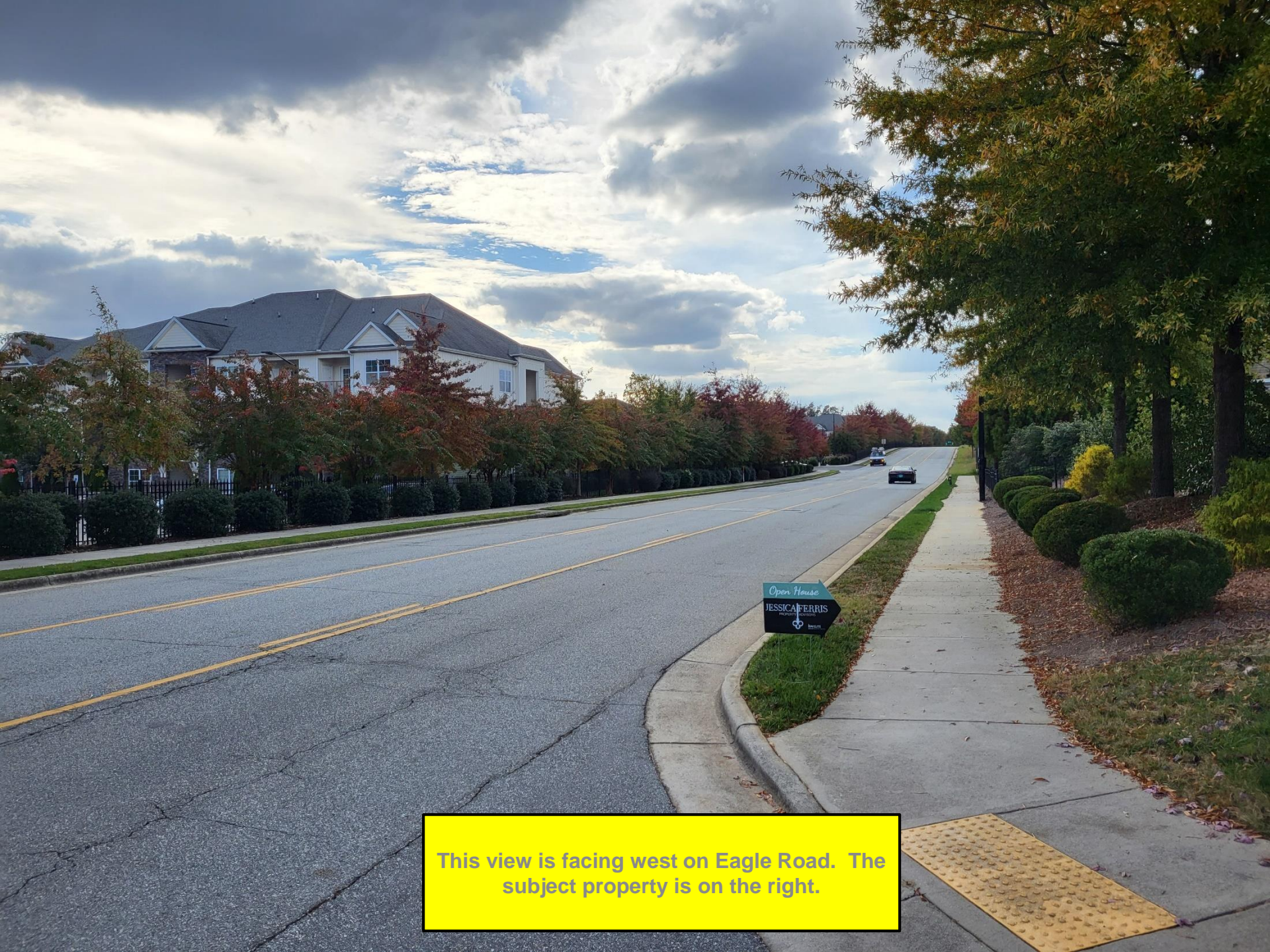
This view is facing west on Eagle Road. The subject property is on the right.