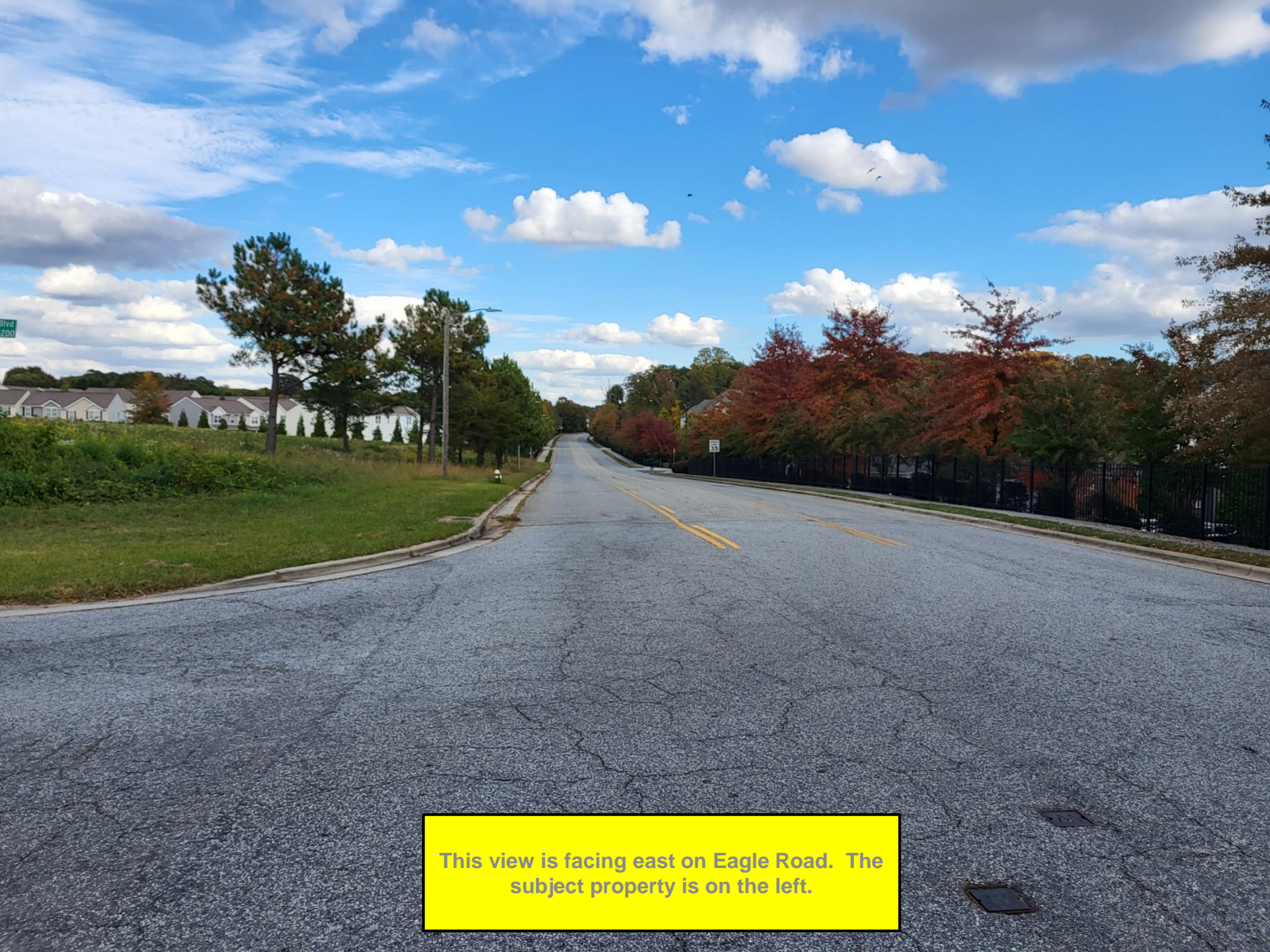
This view is facing east on Eagle Road. The subject property is on the left.