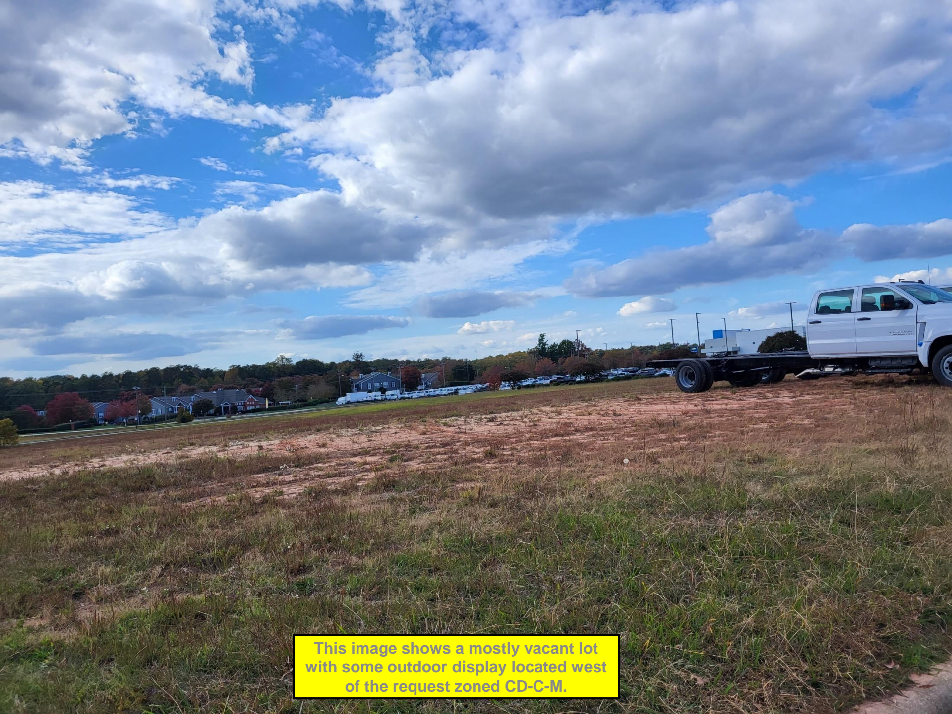
This image shows a mostly vacant lot with some outdoor display located west of the request zoned CD-C-M.