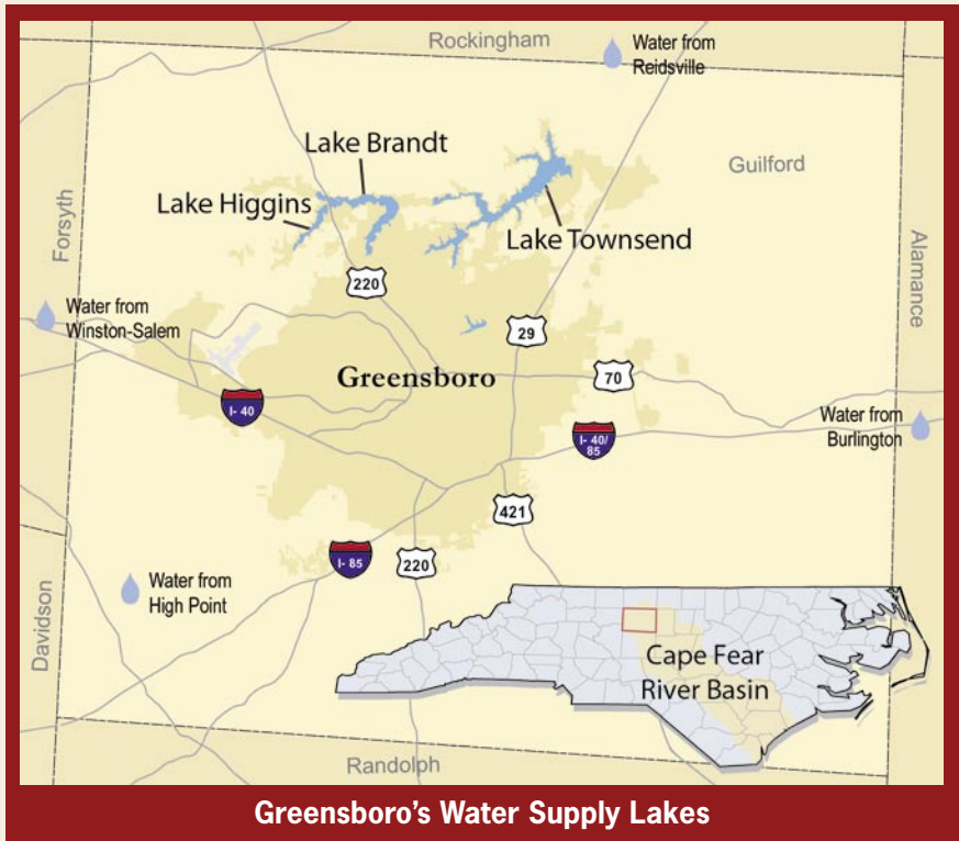
Greensboro's Water Supply Lakes