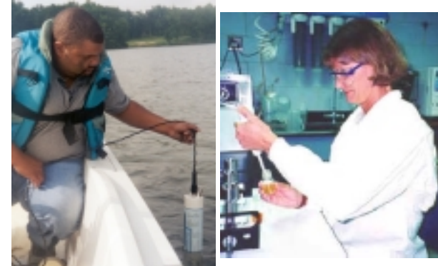
Greensboro's water is regularly tested and monitored

This table shows the results of our monitoring for the period of January 1 to December 31, 1999 and the most recent test results of contaminants that were not due to be tested in 1999. Only contaminants actually detected are listed. Information on other monitored contaminants and the Water Resources Department's