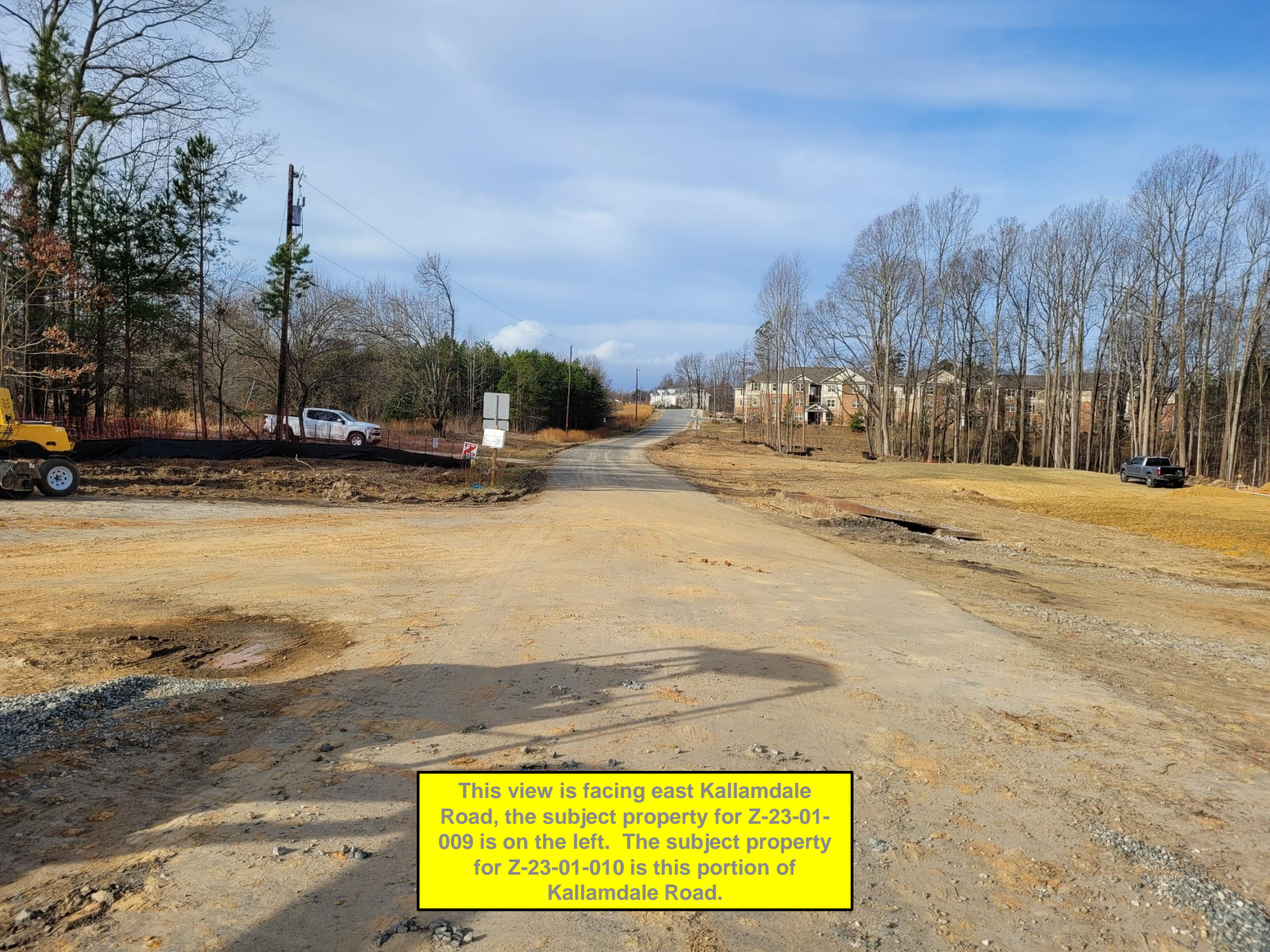
This view is facing east Kallamdale Road, the subject property for Z-23-01-009 is on the left. The subject property for Z-23-01-010 is this portion of Kallamdale Road.