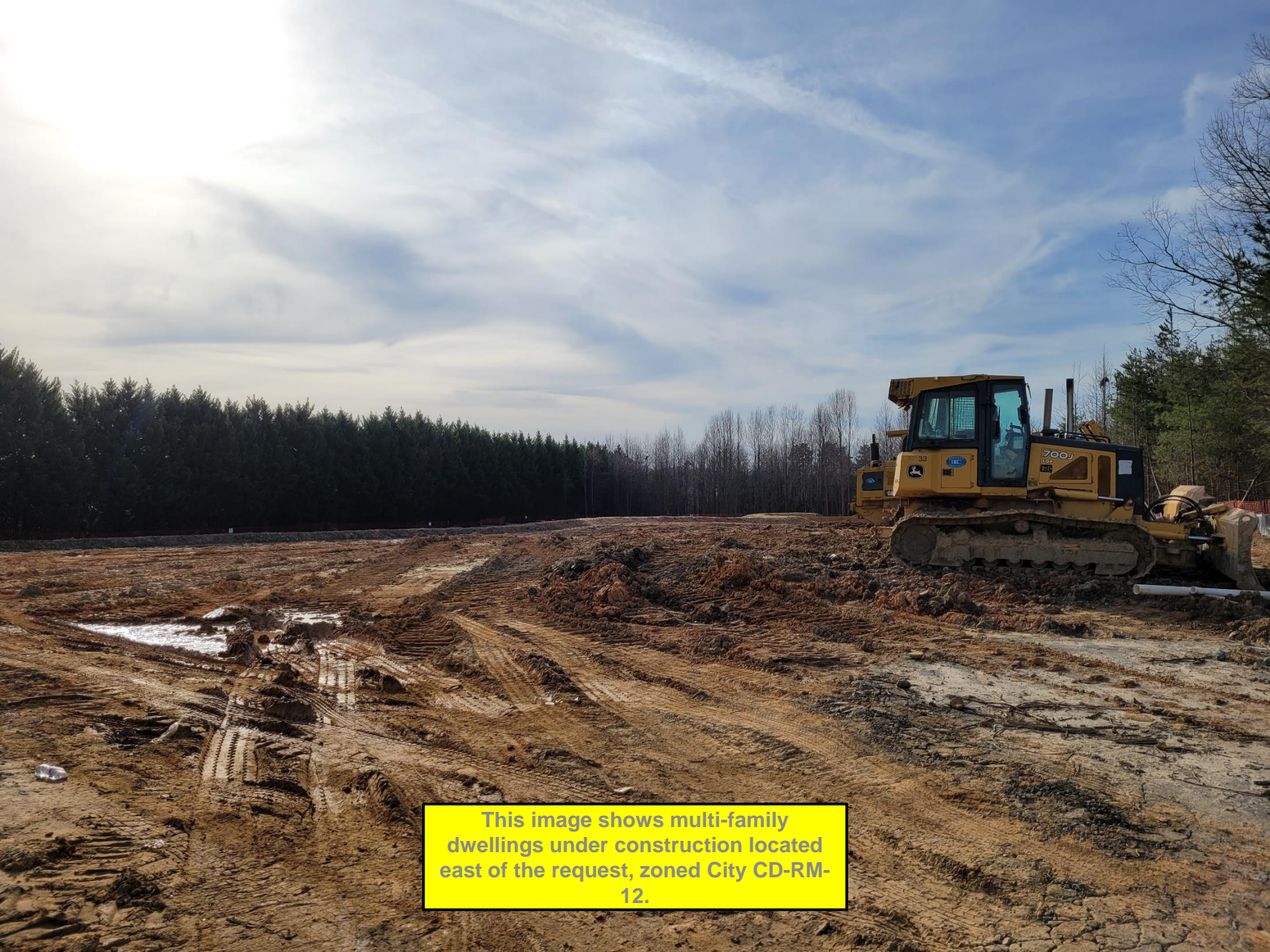
This image shows multi-family dwellings under construction located east of the request, zoned City CD-RM-12.