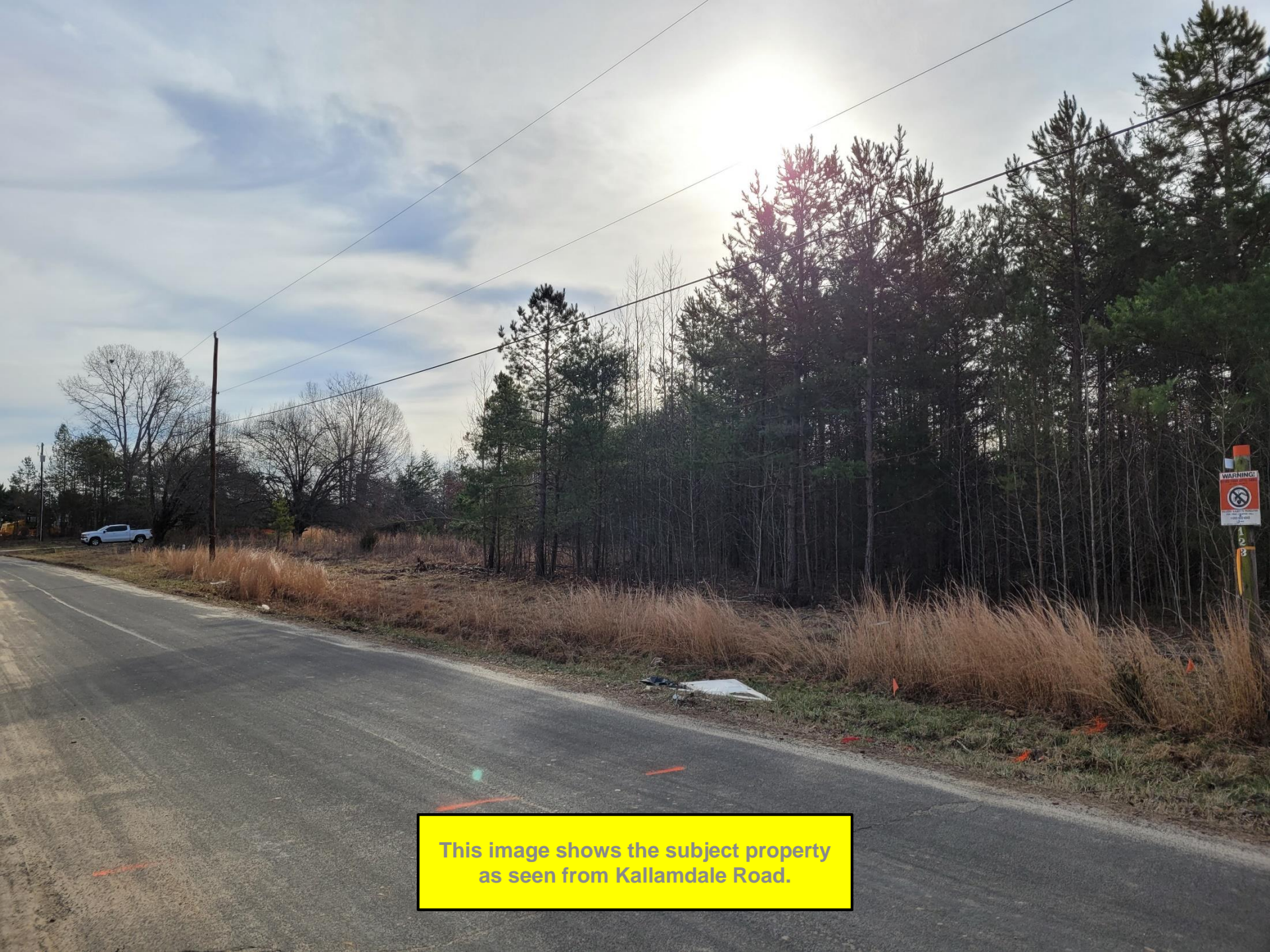
This image shows the subject property as seen from Kallamdale Road.