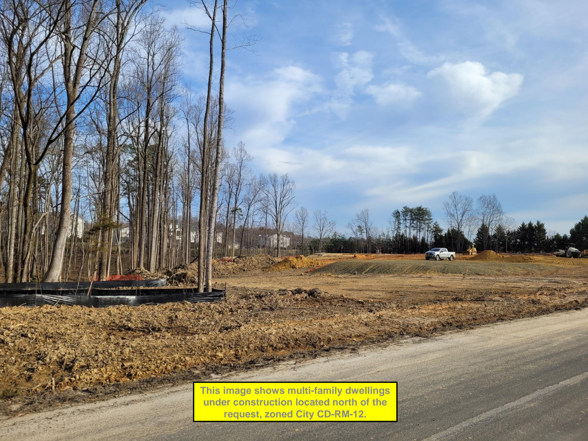
This image shows multi-family dwellings under construction located north of the request, zoned City CD-RM-12.