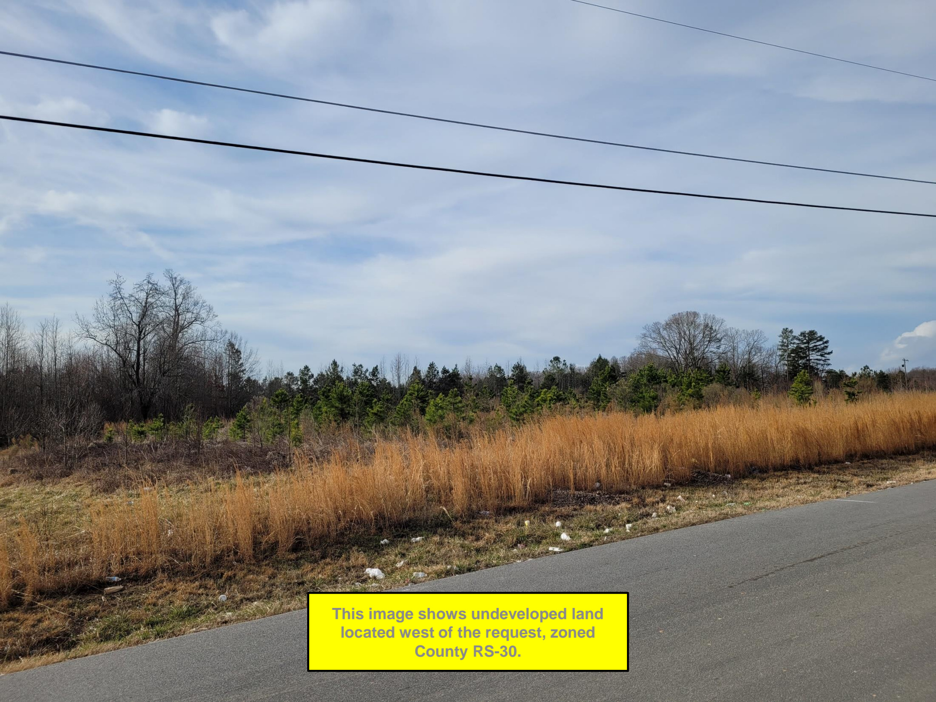
This image shows undeveloped land located west of the request, zoned County RS-30.