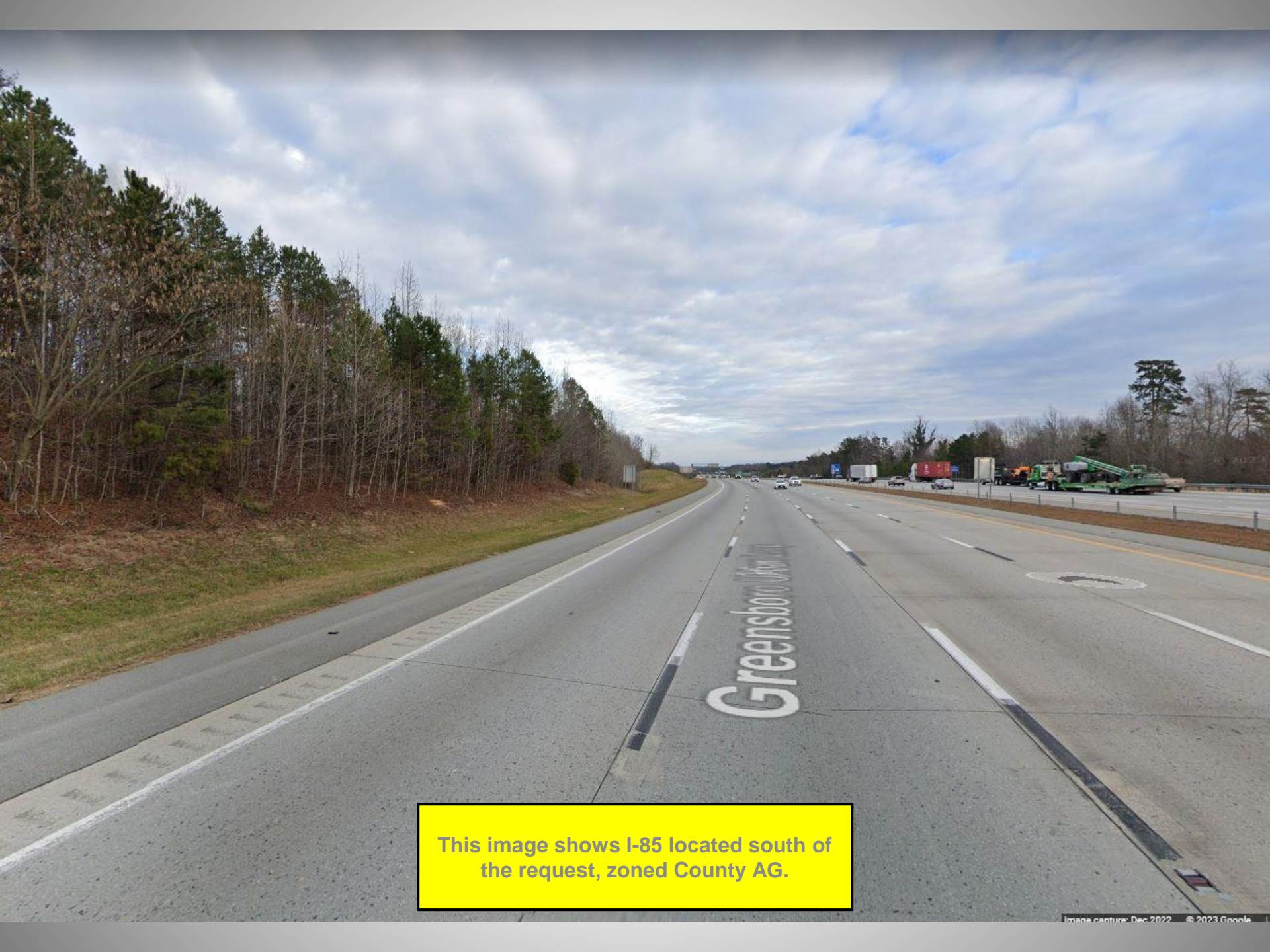
This image shows I-85 located south of the request, zoned County AG.