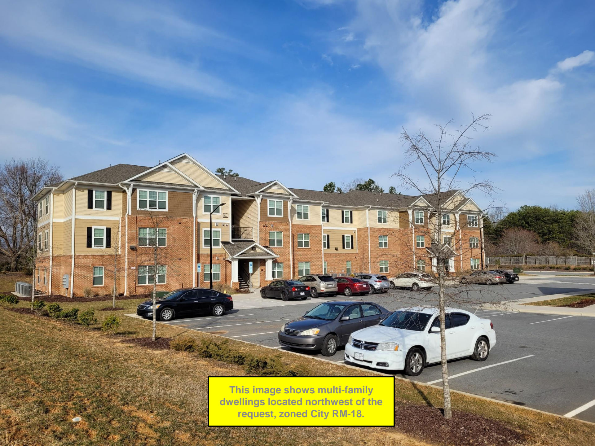
This image shows multi-family dwellings located northwest of the request, zoned City RM-18.