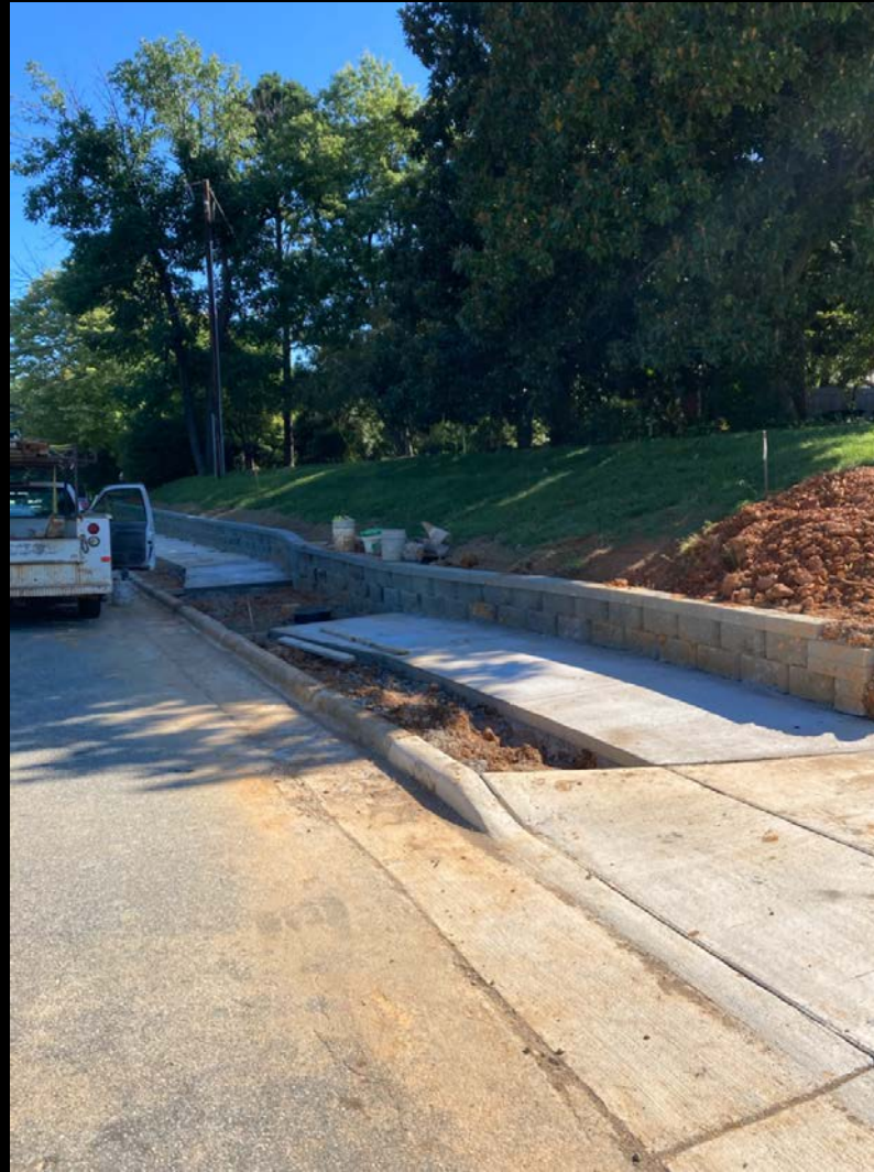
New Garden Road Sidewalk