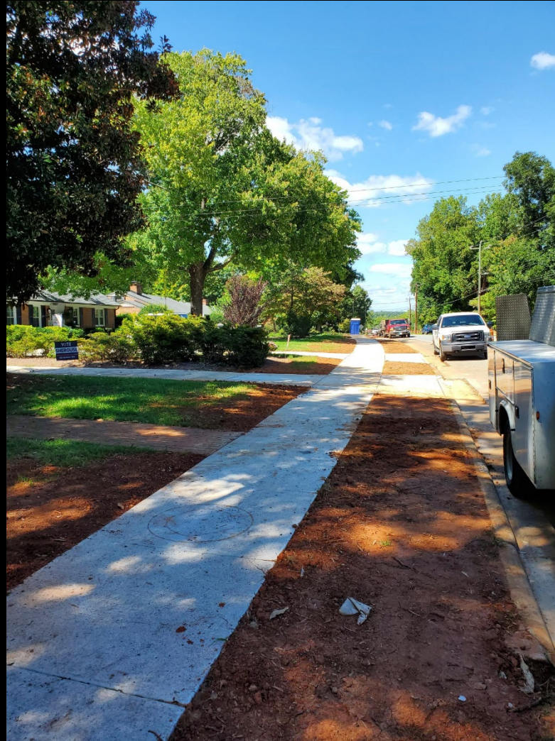
N. Elm Street Sidewalk