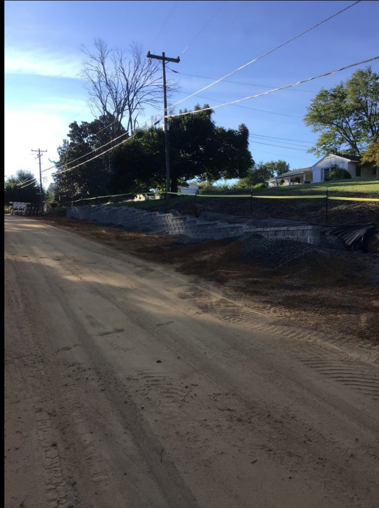
Ballinger Road Bridge