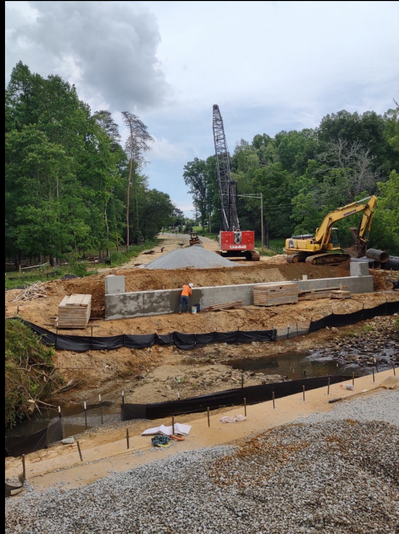
Ballinger Road Bridge