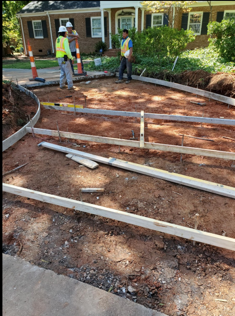
N. Elm Street Sidewalk