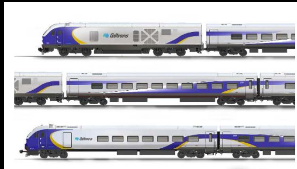
New car style based on CALIDOT models