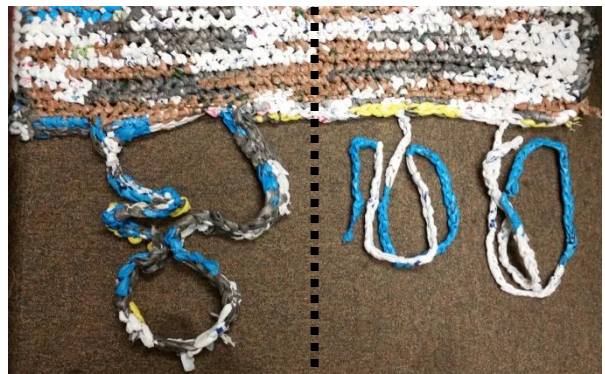
← Figure 4 Completed Bed Roll with Carrying and Tying Straps