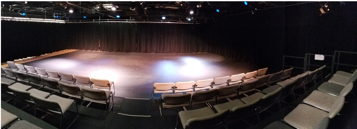
Panoramic shot of stage from back of house

Any photos taken of public programs at the Cultural Center are property of the Creative Greensboro and may be used for promotional purposes.