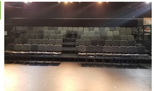
House view from center stage

The deadline for the 2025 Residency at the Hyers Application is December 8, 2024 . Late or incomplete applications will not be considered.