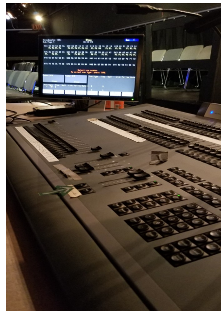
ETC Light Board